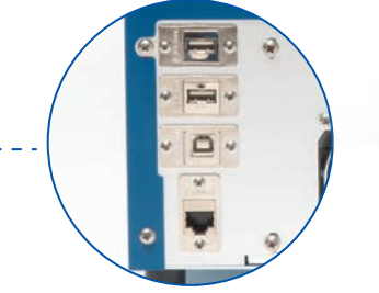
Robust & Flexible Data Management

With only 20 µL sample requirement and an optimized cooling engine able to monitor, control and measure even the most complex samples more accurately & precisely.